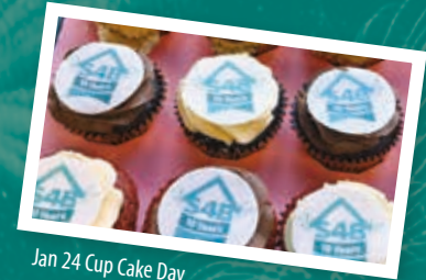
Jan 24 Cup Cake Day

Send a WhatsApp message to 07500 065 270 or email info@s4bmanchesterco.uk .