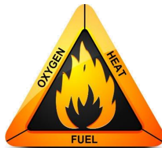
Figure 2. The Fire Triangle

Without one of the three components of the fire triangle, a fire is not sustainable, and the reaction will terminate. This is the foundation of all fire-fighting concepts and procedures.