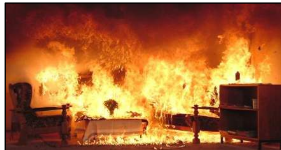
Figure 3. Fire caused by burning combustibles

The burning process (Figure 3) thermally decomposes the fuel source, producing volatile gases from the fuel surface. These volatiles mix with oxygen which results in combustion which generates heat. The additional heat produces more volatile gases and the process repeats.