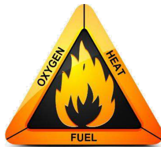
Figure 2. The Fire Triangle

Without one of the three components of the fire triangle, a fire is not sustainable, and the reaction will terminate. This is the foundation of all fire-fighting concepts and procedures.