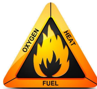
Figure 2. The Fire Triangle

Without one of the three components of the fire triangle, a fire is not sustainable, and the reaction will terminate. This is the foundation of all fire-fighting concepts and procedures.