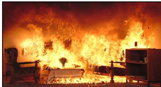
Figure 3. Fire caused by burning combustibles

The burning process (Figure 3) thermally decomposes the fuel source, producing volatile gases from the fuel surface. These volatiles mix with oxygen which results in combustion which generates heat. The additional heat produces more volatile gases and the process repeats.