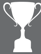
Photo competition winners are: