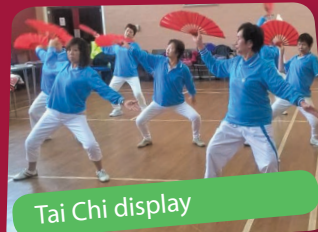
Tai Chi display