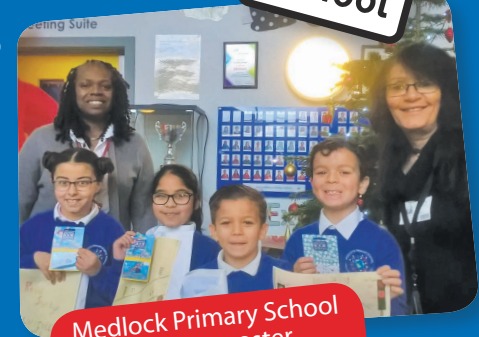
Medlock Primary School - Road safety poster competition winners