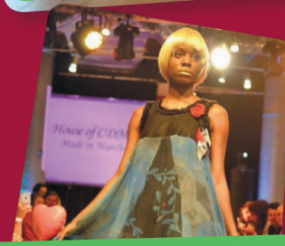
Local designer's fashion show