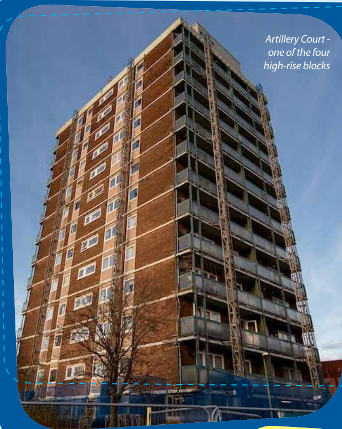
Artillery Court - one of the four high-rise blocks

We will be posting regular updates on the S4B website and the S4B Facebook & Twitter pages, so please take a look for more information.