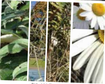
Brunswick in Bloom - Medlock Primary School 2/6/2016