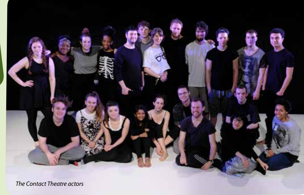
The Contact Theatre actors

The Shrine of Everyday Things will peel back the wallpaper, pull