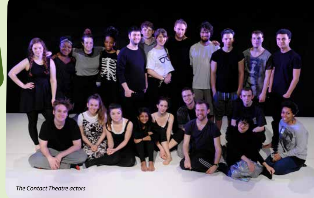
The Contact Theatre actors

The Shrine of Everyday Things will peel back the wallpaper, pull